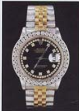
THE BLING Clockwise from left: On the auction block: Lil' Jon's necklace, Missy Elliott's ring and The Notorious B.I.G.'s Rolex.