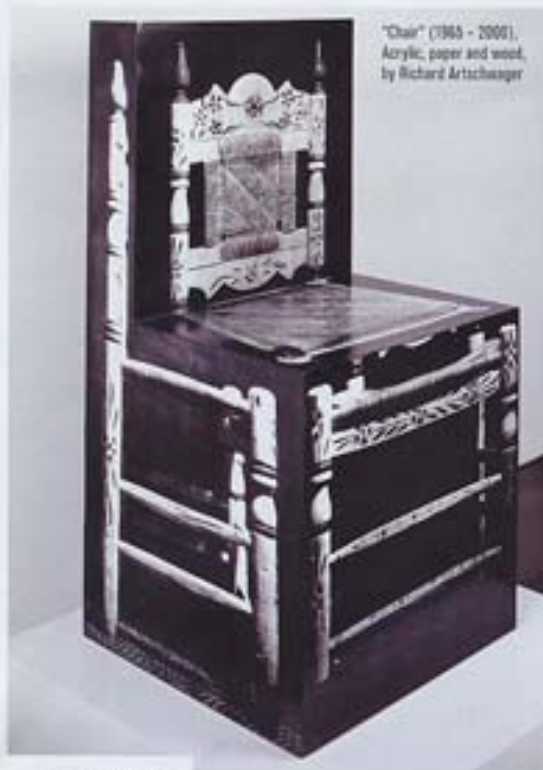
"Chair" (1965 - 2001), Acrylic, paper and wood, by Richard Artschwager